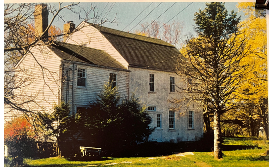
The house that was formerly associated with the Wyckoff/Wade barn

2. 12 - Slow drive-by - Howsel-Wagoner house and stone barn - 172 Stanton Road - Rosalie Fellows Bailey (plate 158). Note: the house number is in green on an electric pole past the house. It is not on the mail box.