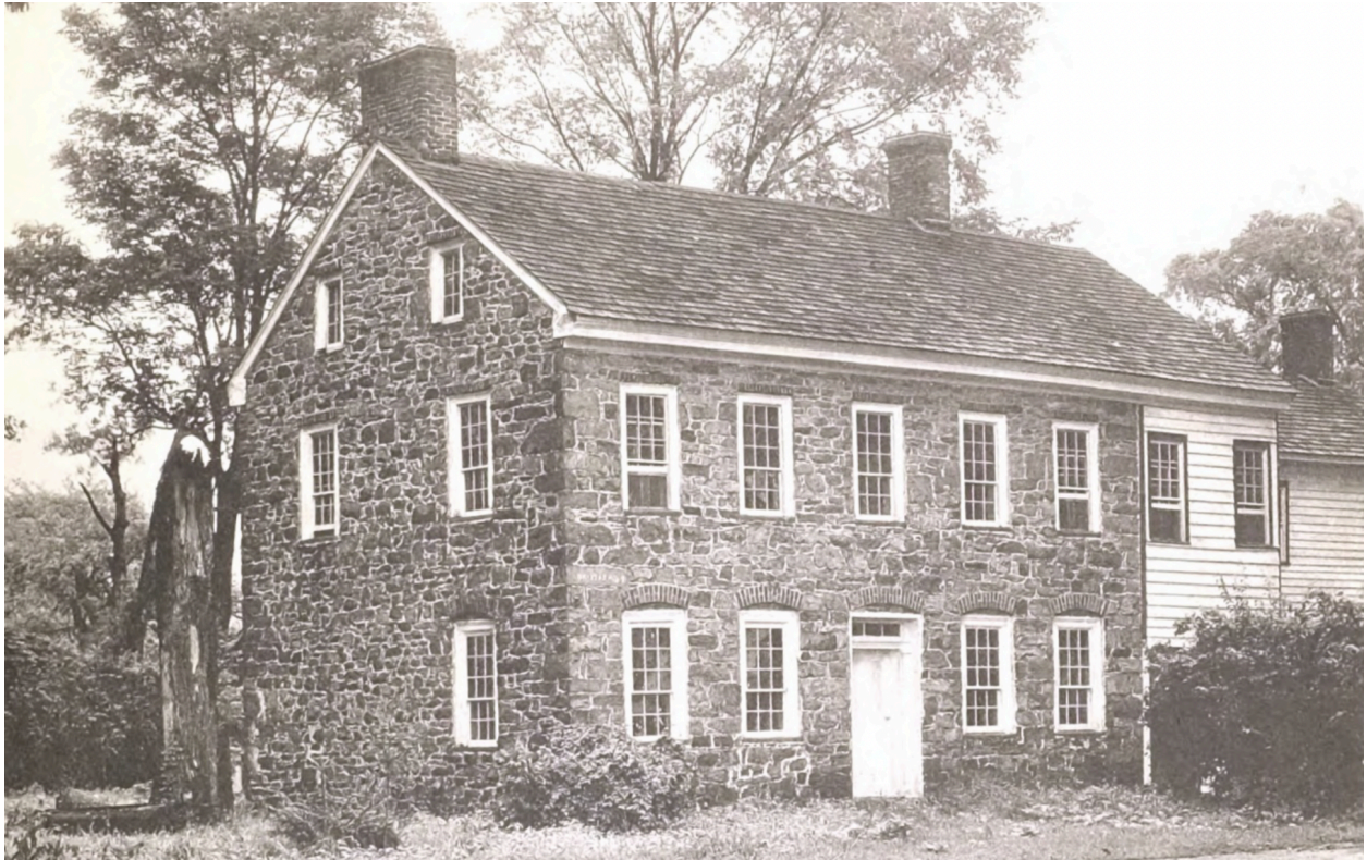
Reynolds-Van Syckel's Tavern

4. 1:30 pm - Reynolds-Van Syckel's Tavern (Corner of Van Syckles Road and Charlestown Road, Union Township, New Jersey). Interior tour with the owner.