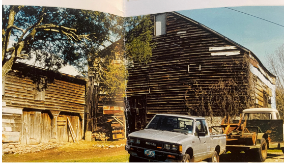
Wyckoff/Wade barn in its original location before it was dismantled.

The Wyckoff -Wade barn was moved to the Bouman-Stickney Farm from the Wade Farm off Readington Road in Readington Township in 2000 by the New Jersey Barn Company. It was believed to have been built by John Wyckoff, a second generation American of Dutch ancestry. The anchor beams are 27' long. The center aisle is 27' x 41'. The photo below shows the barn in its original location and raised for more hay storage. The associated house had two walls stone and two walls frame.