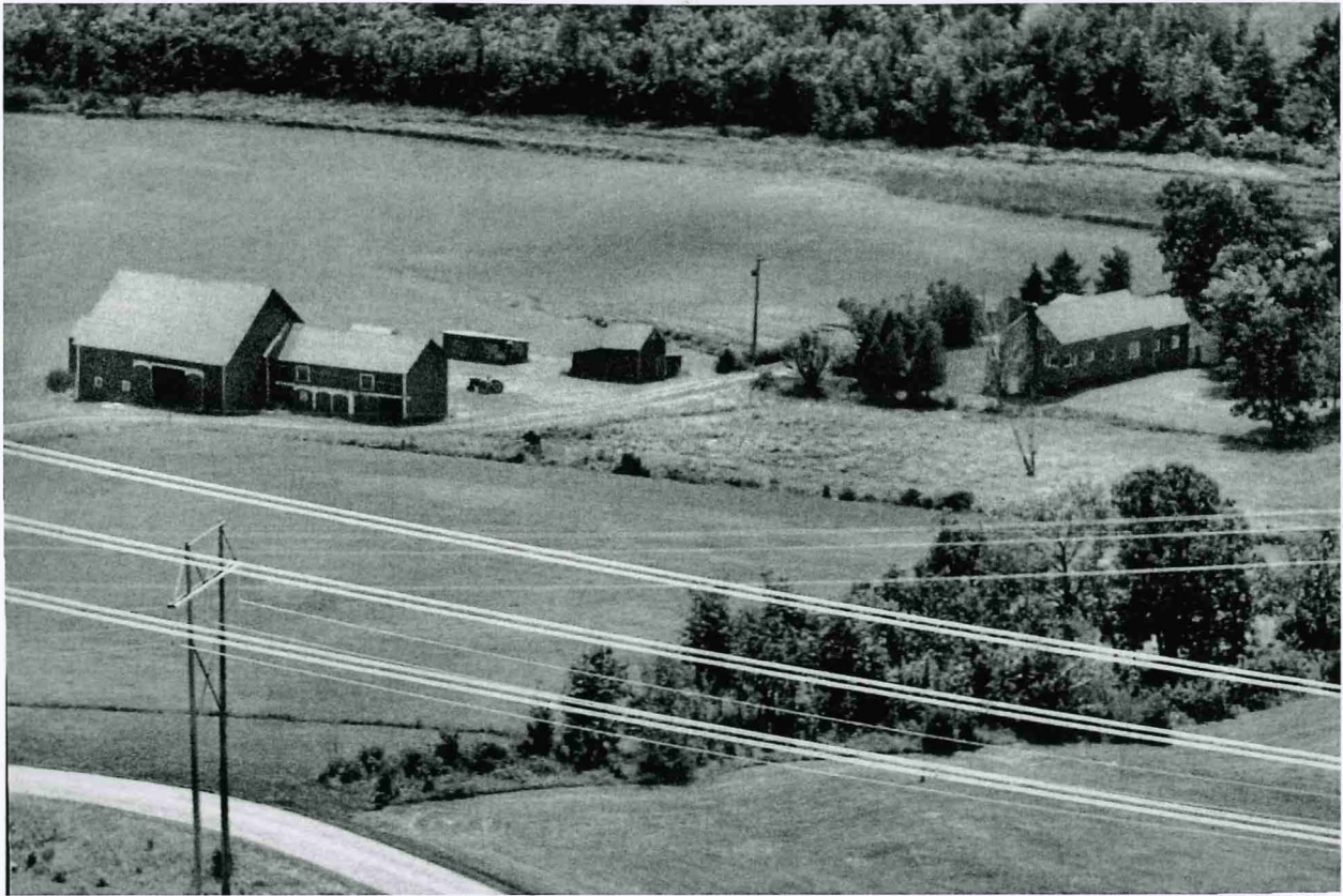
Vintage Aerial August 1, 1964